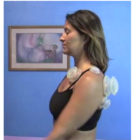
Cup and Stretch for the Rotator Cuff